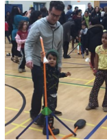
STEM Family Night